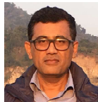
By- Kamal Baruah

Whatever be the motive, the attempt by congress party as opposition, and the case filed against the defected MLAs under the 10 th Scheduled of the Indian Constitution is the revelation about the existence of check and balance system to the working of the Indian Constitution. The autocratic nature of any government in the power is checked with the existing provisions under the law of the country even as there are rumours about the judiciary being controlled by those in the government. The beauty of the Indian Constitution finally is shown with the series of events in the political theatre of Manipur. As for those MLAs who are going to face the music they should not admit that they are not liable to be representative of the people. If in case they don't accept they mistake then people should teach them lesson.